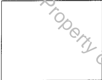
(Use this space for notary stamp/seal)

Notary Public Print Name _____ My commission expires _____