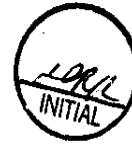
Exhibit "A" Attached to Mortgage