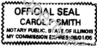
Notary Public in said County and State