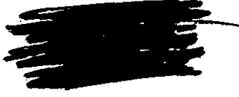
EXHIBIT C INSURANCE REQUIREMENTS

Property of Cook County Clerk's Office A large, stylized handwritten signature in black ink is written across the center of the page, overlapping the diagonal watermark text.