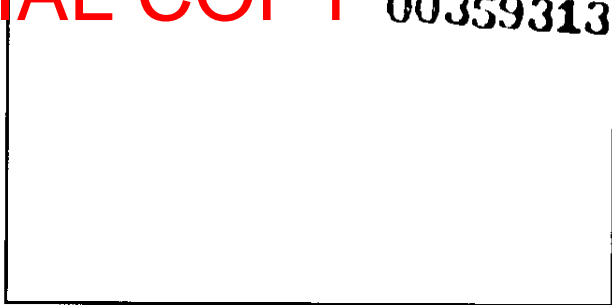
EXHIBIT B (Ford City)