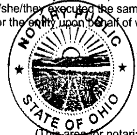
(This area for notarial seal)