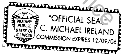
Signature of Notary