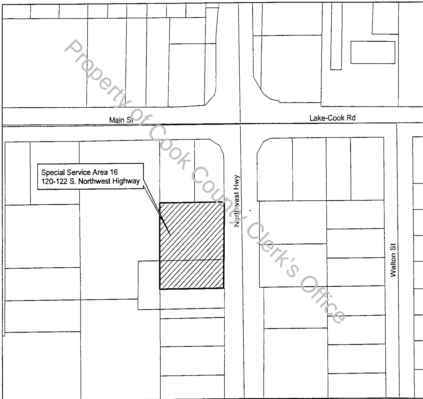
EXHIBIT 3 (Page 1 of 2)