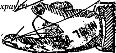
EXHIBIT "A" Legal Description