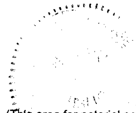
(This area for notarial seal)