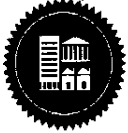
Exhibit "A" UNOFFICIAL COPY FIDELITY NATIONAL TITLE INSURANCE COMPANY

203 N. LASALLE ST. #2200, CHICAGO, ILLINOIS 60601