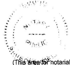
(This area for notarial seal)