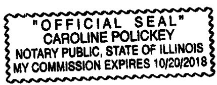
(Seal or Stamp)

GIVEN UNDER MY HAND AND OFFICIAL SEAL the day and year in this certificate first above written.