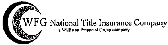
EXHIBIT "A" ALTA COMMITMENT