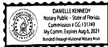
DANIELLE KENNEDY COMM EXPIRES: 08/06/2021

Document Prepared By: Dave LaRose/NTC, 2100 Alt. 19 North, Palm Harbor, FL 34683 (800)346-9152 FNMA1 405801437 2019-RPL2-PL1-SALE DOCR T281908-12:45:23 [C-1] EFRMIL1