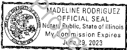
(Official Seal or Stamp)