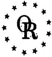
Exhibit A - Legal Description ALTA COMMITMENT

The land referred to in the Commitment is described as follows: