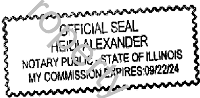
(Official Seal or Stamp)