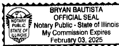
Exhibit A (Legal Description)

SITUSTED IN THE COUNTY OF COOK AND STATE OF ILLINOIS: