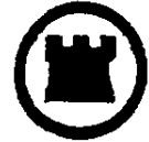
Exhibit # 6

Special Search Department (312) 690-2582/2583