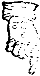
Figure Above This Line For Recording Date

This instrument was prepared by: MARGARETTEN & COMPANY INC 625 NORTH CT. PALATINE, IL 60067