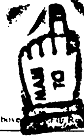
Above and to the Right of Recorder's Use Only

DOE KINGER 20180 GAVENNA HWY OLYMPIA WASH 98511 6/16