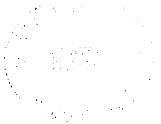
EXHIBIT - 10/10/11 COUNTY OF COOK, ILLINOIS CLERK OF COURTS