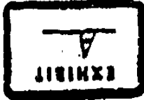
EXHIBIT FOR INGRESS AND EGRESS OF VEHICLES AND PEDESTRIAN TRAFFIC FOR THE BENEFIT OF PARCEL 1 AS SET FORTH IN EASEMENT AGREEMENT.