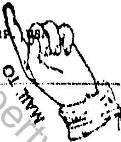
Exhibit Title 410 N. LaSalle/Section 402 Chicago, IL 60610