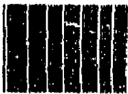
Table: C.A.M. Form 3014 9/90 MAF