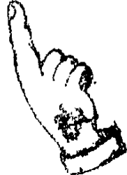
Exhibit A Legal Description

UNIT 69 IN EAGLE RIDGE CONDOMINIUM, AS DELINEATED ON A SURVEY OF THE FOLLOWING DESCRIBED REAL ESTATE: CERTAIN PARTS OF THE EAST 1/2 OF THE SOUTH WEST 1/4 AND WEST 1/2 OF THE SOUTH EAST 1/4 OF SECTION 32, TOWNSHIP 36 NORTH, RANGE 12 EAST OF THE THIRD PRINCIPAL MERIDIAN, WHICH SURVEY IS ATTACHED AS EXHIBIT "A" TO THE DECLARATION OF CONDOMINIUM RECORDED AS DOCUMENT NUMBER 89443063 AND AS AMENDED FROM TIME TO TIME TOGETHER WITH ITS UNDIVIDED PERCENTAGE INTEREST IN THE COMMON ELEMENTS IN COOK COUNTY, ILLINOIS.