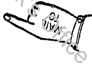
EXHIBIT "A" Legal Description