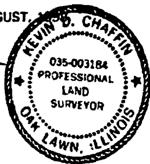
KEVIN CHAFFIN IPLS# 3184

KDC CONSULTANTS* P.O. BOX 838 * OAK LAWN * ILLINOIS * 60454 708-645-0545 FAX 645-0546