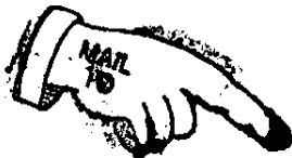
Lona N. Louis Village Clerk