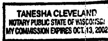
Notary Public TANESHA CLEVELAND